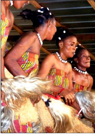
Ivory Coast Dancers

Would you like a taste of the real Ivory Coast?